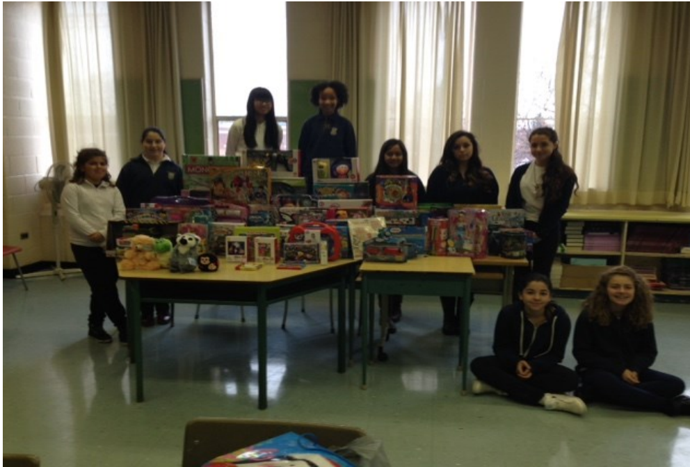
The Me to We Committee with some of the toys collected during the Toy Drive.