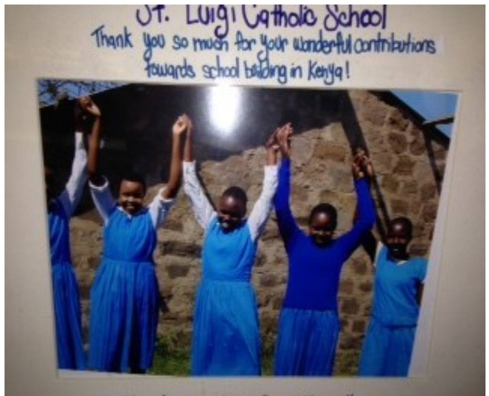
A photo of some students outside the village school in Mwangaza, Kenya that the contributions from the St. Luigi Community helped build.